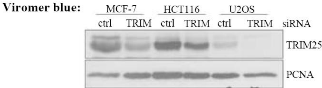
Fig. 1: Knockdown of control and target gene in MCF-7, HCT116 and U2OS cells transfected with Viromer® BLUE